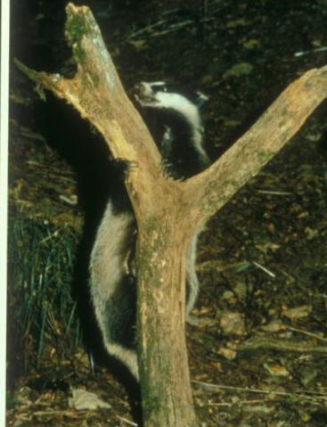
Look for badger trails in the woods and fields. (They usually wall along the same trails every day.