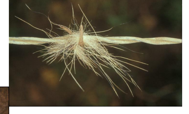
What colours are a badger's face?

This is badger hair on barbed wire. Can you see the bands of black, white and brown?