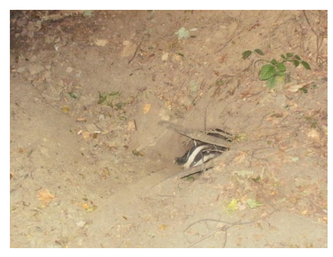
Luckily, the badger didn't seem to know that it was being watched intently from such a close distance. Without any natural predators in this country, man and his dogs is usually the badger's greatest enemy. These badgers couldn't know that these people were actually their

After a wait, their patience was at last rewarded with the sighting of the first badgers to emerge. The first