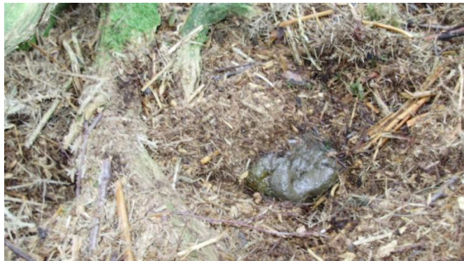
A badger dung pit

"One thing to consider," said Dan, "is that cattle don't like feeding near to badger dung pits, but badgers will readily turn over cow pats to look for grubs, beetles and worms. So we've got to consider which way infections travel."